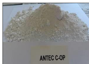
高岭土 AnTec C-OP Calcined Kaolin