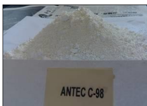
高岭土 AnTec C-98 Calcined Kaolin