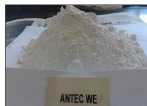
高岭土 AnTec WE Calcined Kaolin